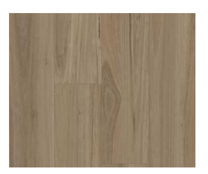
Tasmanian Oak Select