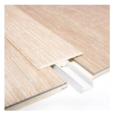
Expansion Cover TIVEXC(-) 2400 x 45mm Matching low profile and waterproof expansion cover