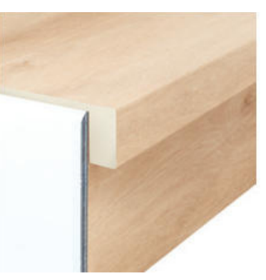
Stair Nose TIVSTP(-) 2400 x 110 x 36mm Matching 'custom look' stair nose to finish stairs beautifully