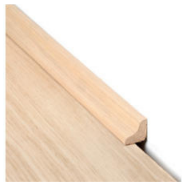
Scotia TIVSCOT(-) 2400 x 15 x 15mm Discreet 15mm matching and waterproof scotia