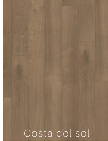
Costa del sol