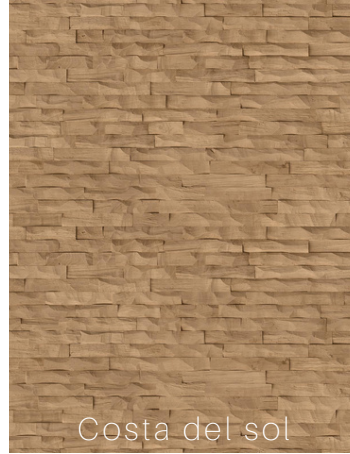
Costa del sol